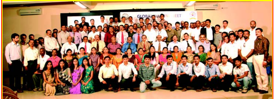
Global Alumni Meet at Milagres Convention Centre, Hampankatta, Mangalore on 03.12.2012.